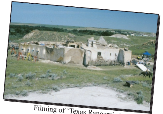
Filming of 'Texas Rangers' at Dinosaur Provincial Park

Applicants must provide either a film script or written description of the production with their application. The application must contain sufficient information to determine if the activity should be permitted. The description must explicitly describe and document any use of wild or domestic animals, non-native plant species, fire or explosives, chemicals, artificial snow, fog machines, high risk activities or stunts, discharge of firearms, safety/emergency response planning, facility modification or new construction, off-highway vehicle use or similar activities.